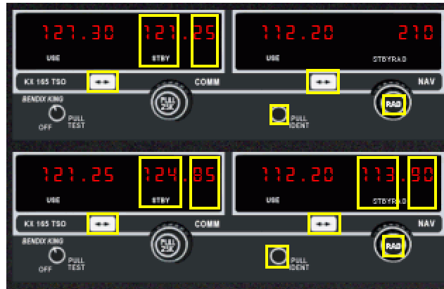
KX 165 hotspots

The KX165 transceivers provide full COM and NAV functions.