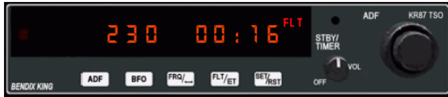
KR87 ADF Receiver

The KR87 ADF receiver is a modern ADF receiver with a built-in timer. Both the Flight Time mode and the Elapsed Time mode of the timer are implemented.